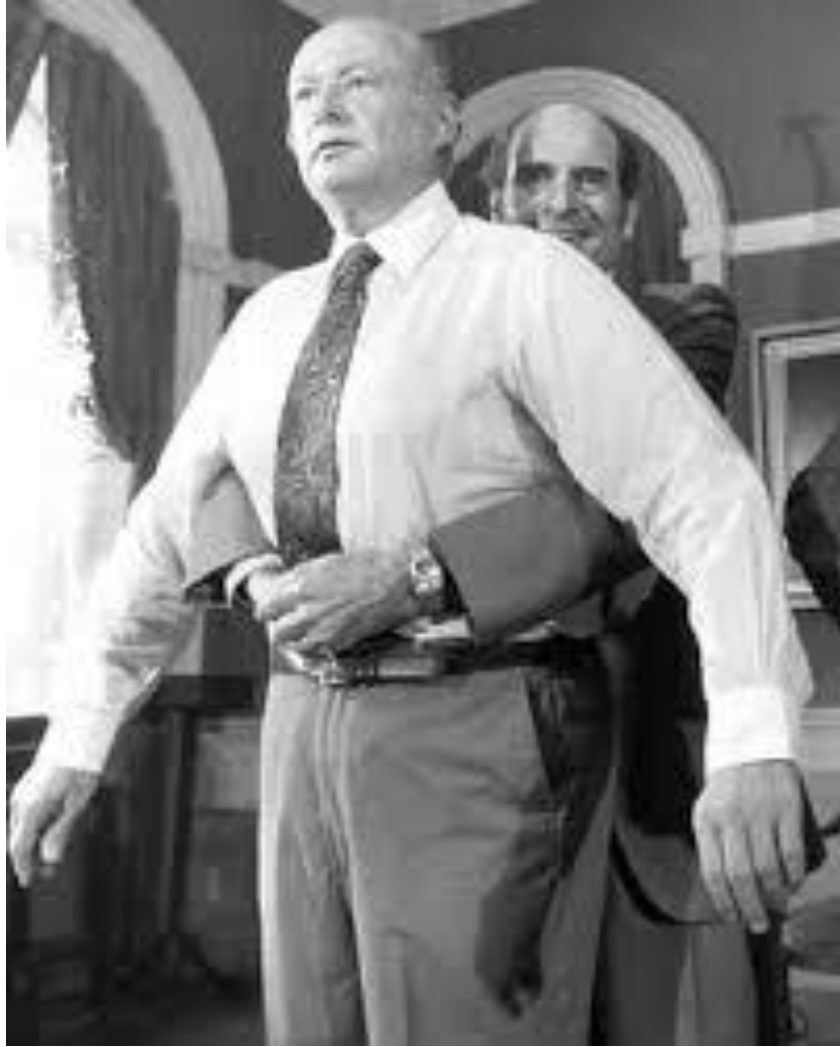
Dr. Henry Heimlich